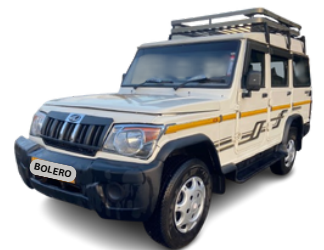
Bolero + Commercial